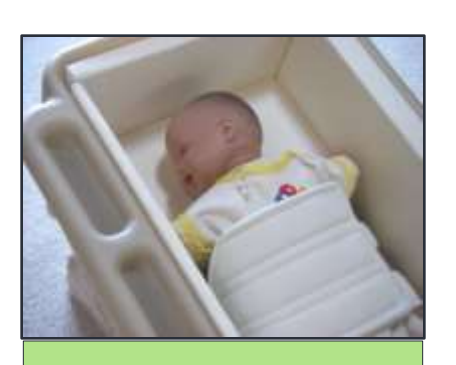
Prone Position Restraint Bag with adjustable cummerbund

Supine Position Restraint Bag with adjustable cummerbund