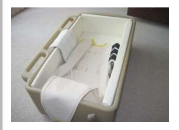
Restraint Bag features dual entry zippers