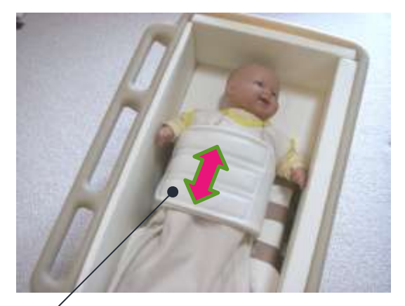
Cummerbund available in two sizes -- adjusts for best position on child