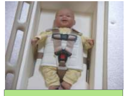
Supine Position 3-point harness with adjustable cummerbund