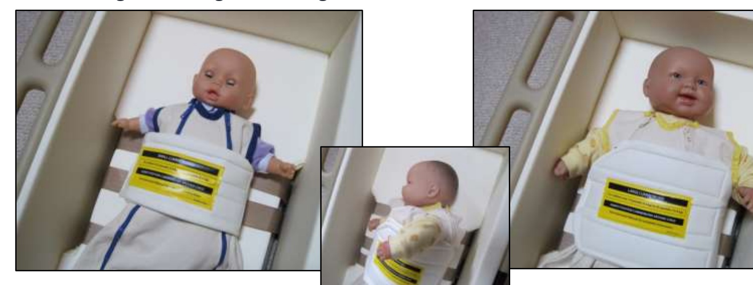
Small Restraint Bag 4.5 to 10 pounds