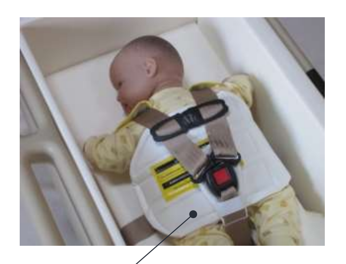
Cummerbund adjusts for best position on child in prone position. Protects child from buckle and chest clip while in prone position.