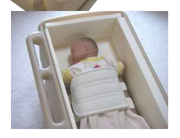
Prone position in restraint bag must have medical approval