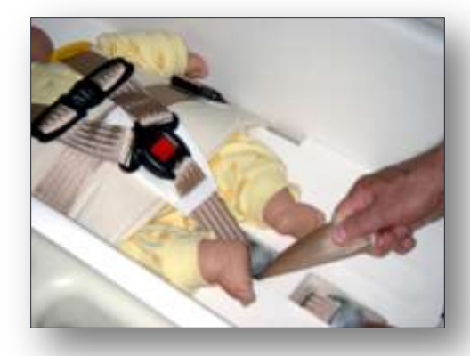
Adjustable buckle with vinyl pad provides best fit for child